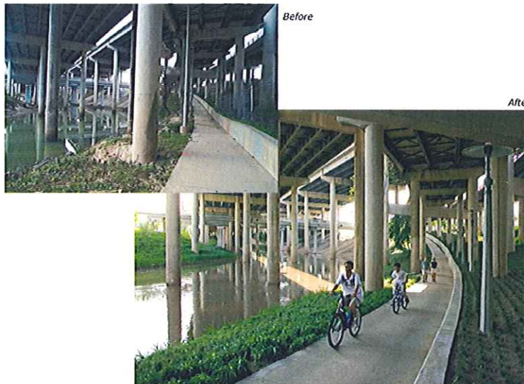
Buffalo Bayou Promenade, Houston, TX Before and After

http://www.theatlanticcities.com/design/2011/09/under-overpass-projects-under-freeways/192/#slide1