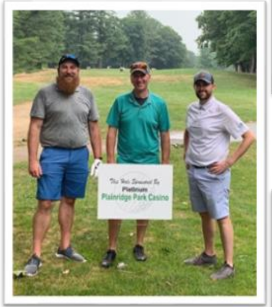
Q3 PPC Guide Dogs of America, Foley Invitational Machinist Union Golf Tournament