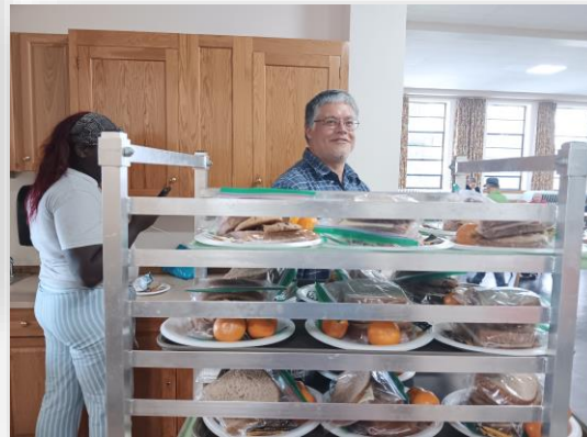
Loaves and Fishes