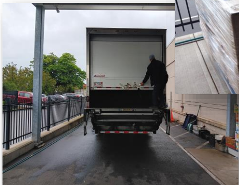
Springfield Rescue Mission