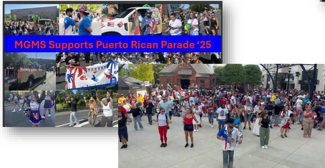
Springfield Puerto Rican Parade & Salsa Sal Pa Fuera