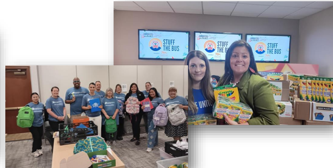
Stuff a Bus for United Way