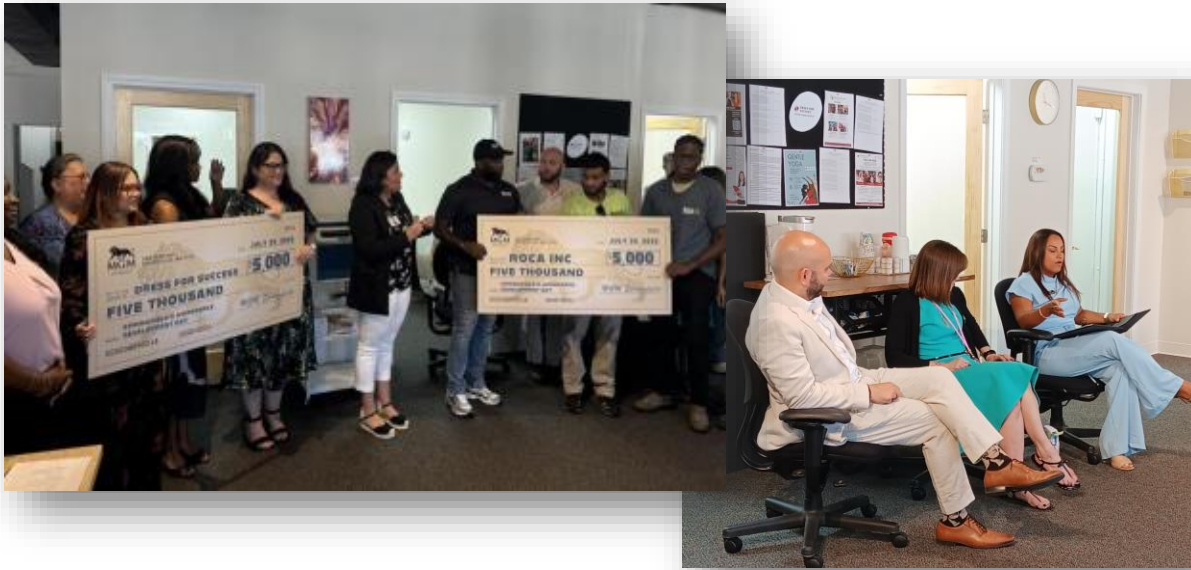
ROCA & Dress for Success