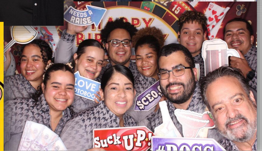
MGM Turns Lucky Number "7"