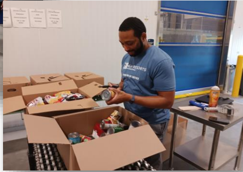
Food Bank of Western Mass