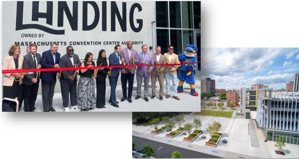
MMC Plaza Ribbon Cutting