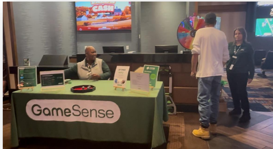
RGEM at MGM