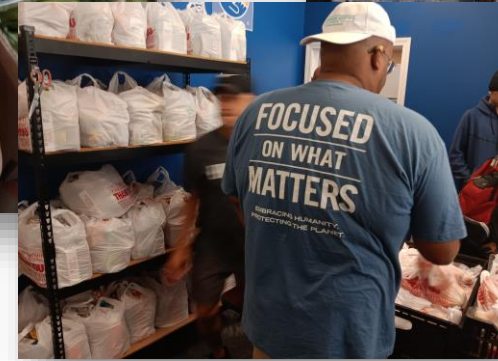
United Way Grocery Distribution