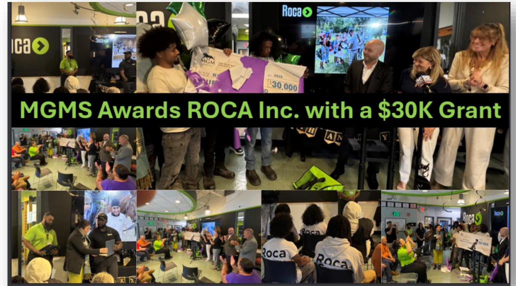
ROCA Check Donation