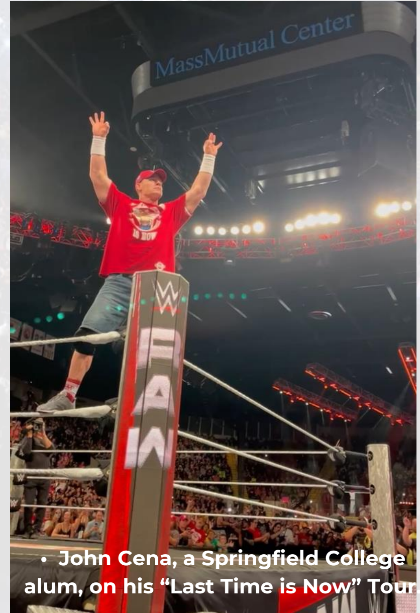
• John Cena, a Springfield College alum, on his "Last Time is Now" Tour