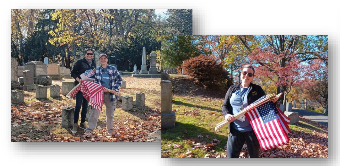
O720 O720 O720 O720 O720 O720 O720 O720 O720 O720 O720 O720 O720 O720 O720 O720 O720 O720 O720 O720 O720 O720 O720 O720 O720 O720 O720 O720 O720 O720 O720 O720 O720 O720 O720 O720 O720 O720 O720 O720 O720 O720 O720 O720 O720 O720 O720 O720 O720 O720 O720 O720 O720 O720 O720 O720 O720 O720 O720 O720 O720 O720 O720 O720 O720 O720 O720 O720 O720 O720 O720 O720 O720 O720 O720 O720 O720 O720 O720 O720 O720 O720 O720 O720 O720 O720 O720 O720 O720 O720 O720 O720 O720 O720 O720 O720 O720 O720 O720 O720 O720 O720 O720 O720 O720 O720 O720 O720 O720 O720 O720 O720 O720 O720 O720 O720 O720 O720 O720 O720 O720 O720 O720 O720 O720 O720 O720 O720 O720 O720 O720 O720 O720 O720 O720 O720 O720 O720 O720 O720 O720 O720 O720 O720 O720 O720 O720 O720 O720 O720 O720 O720 O720 O720 O720 O720 O720 O720 O720 O720 O720 O720 O720 O720 O720 O720 O720 O720 O720 O720 O720 O720 O720 O720 O720 O720 O720 O720 O720 O720 O720 O720 O720 O720 O720 O720 O720 O720 O720 O720 O720 O720 O720 O720 O720 O720 O720 O720 O720 O720 O720 O720 O720 O720 O720 O720 O720 O720 O720 O720 O720 O720 O720 O720 O720 O720 O720 O720 O720 O720 O720 O720 O720 O720 O720 O720 O720 O720 O720 O720 O720 O720 O720 O720 O720 O720 O720 O720 O720 O720 O720 O720 O720 O720 O720 O720 O720 O720 O720 O720 O720 O720 O720 O720 O720 O720 O720 O720 O720 O720 O720 O720 O720 O720 O720 O720 O720 O720 O720 O720 O720 O720 O720 O720 O720 O720 O720 O720 O720 O720 O720 O720 O720 O720 O720 O720 O720 O720 O720 O720 O720 O720 O720 O720 O720 O720 O720 O720 O720 O720 O720 O720 O720 O720 O720 O720 O720 O720 O720 O720 O720 O720 O720 O720 O720 O720 O720 O720 O720 O720 O720 O720 O720 O720 O720 O720 O720 O720 O720 O720 O720 O720 O720 O720 O720 O720 O720 O720 O720 O720 O720