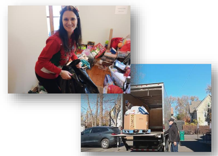
Gray House Winter Essentials Donation