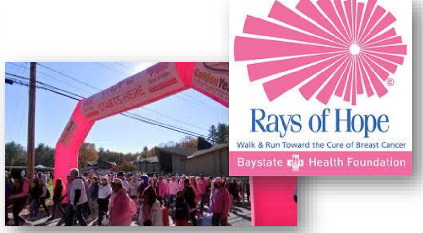
Rays of Hope Walk to Cure Cancer