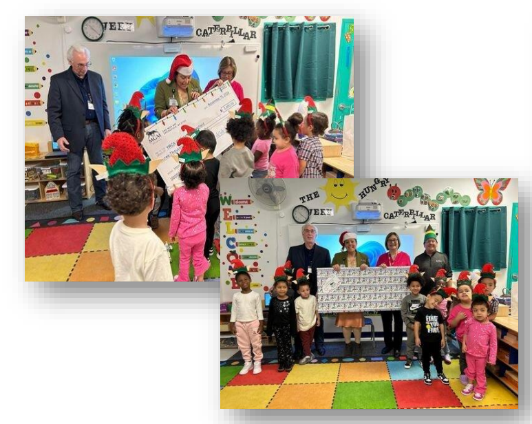
YMCA Holiday Event & Donation