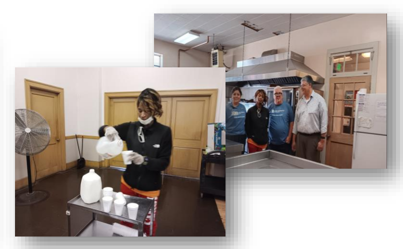
Loaves & Fishes