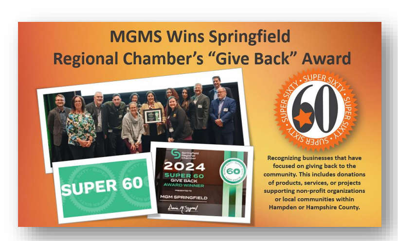
"Give Back" Award