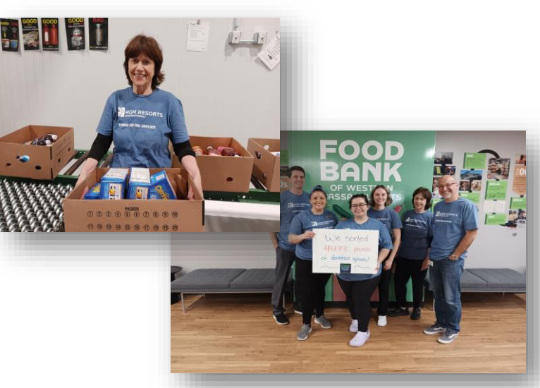
Food Bank of Western Mass