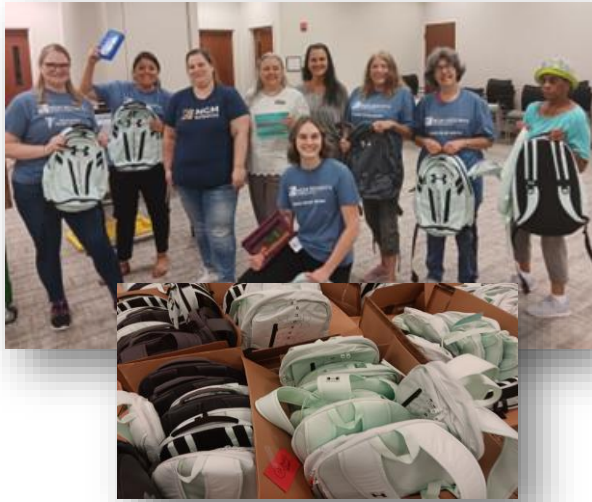
500 Filled Backpacks Donated