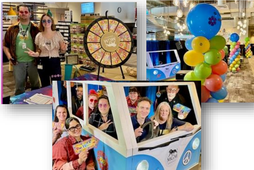
MGM Springfield 6th Anniversary