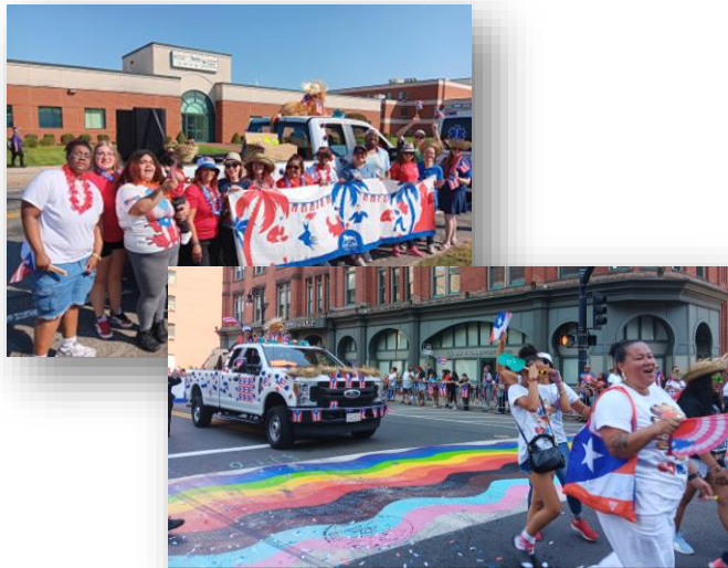
Springfield Puerto Rican Parade