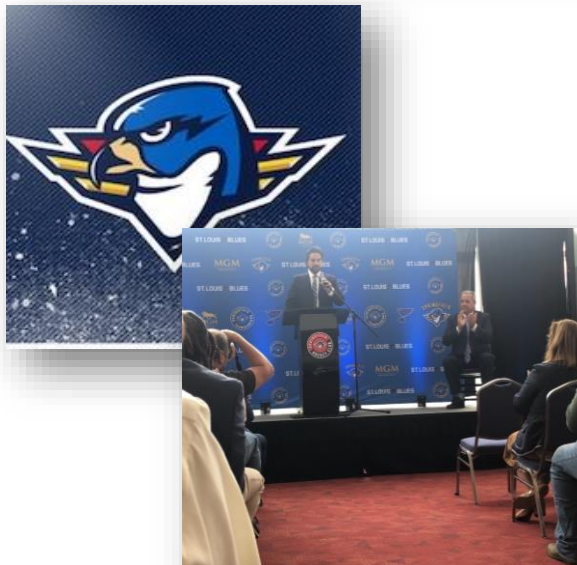
Springfield Thunderbirds Sponsorship