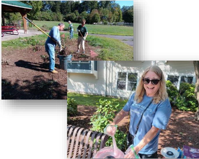
Springfield Park Cleanup