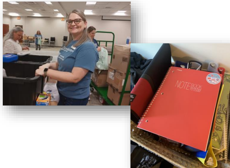
School Supply Donation