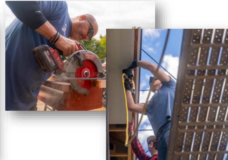
Habitat for Humanity