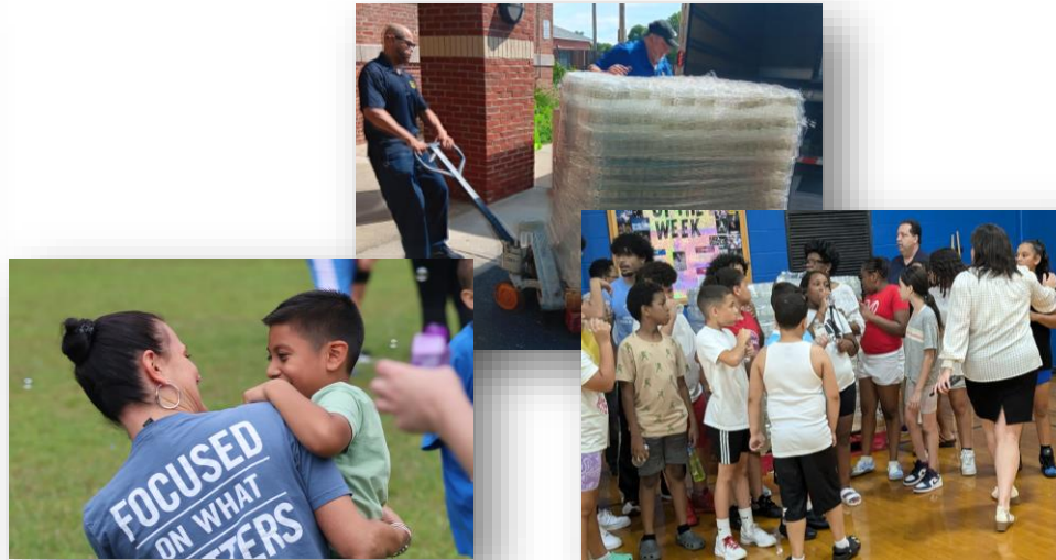
Water Donation: Square One & Boys & Girls Club