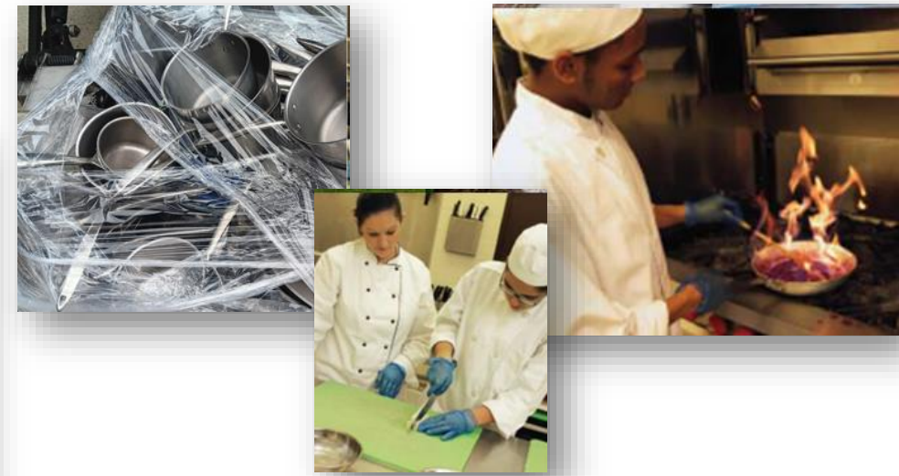
Equipment Donation: Putnam Vocational HS