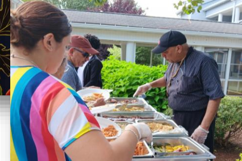
1,800 Meals Served