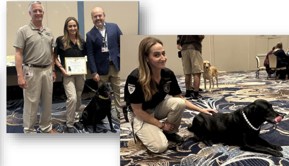
K9 Essie Retirement