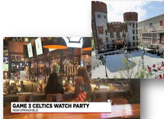
Celtics Plaza Watch Party