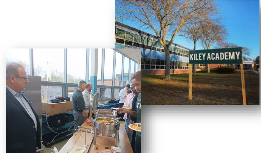
Teacher Appreciation Week