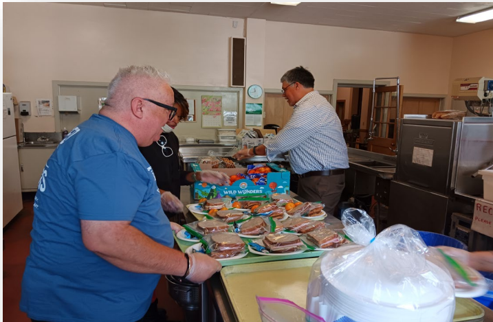
Loaves & Fishes Volunteer Event