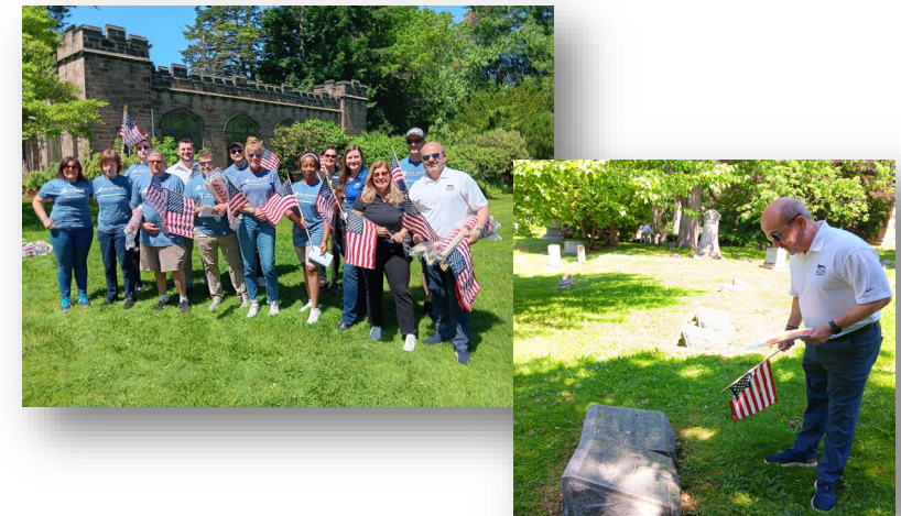
Memorial Day Cemetery Flag Event