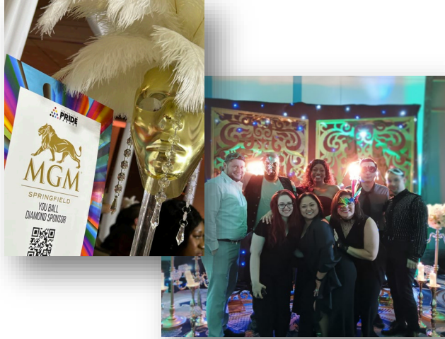
Pride 'You Ball'