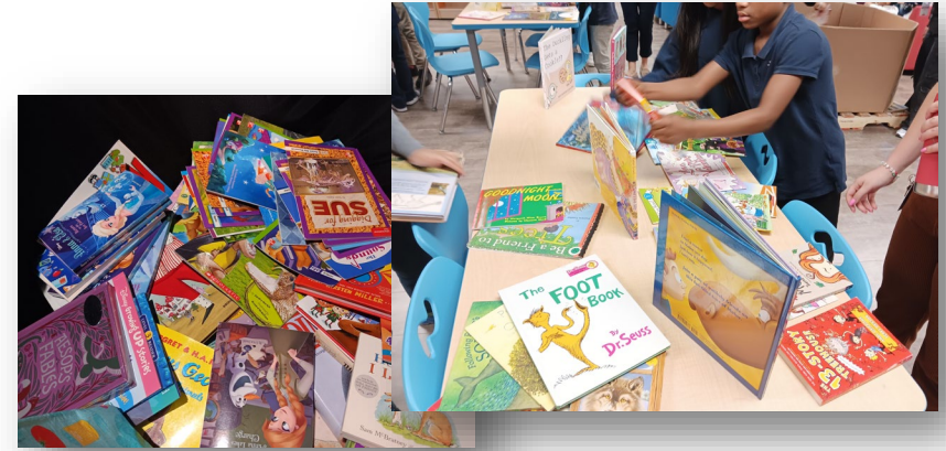
500+ Book Donation to Springfield School