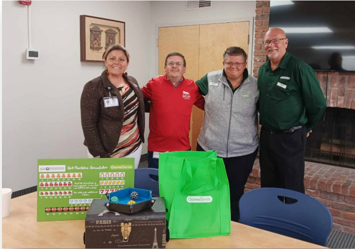
GameSense Presentation at JCC