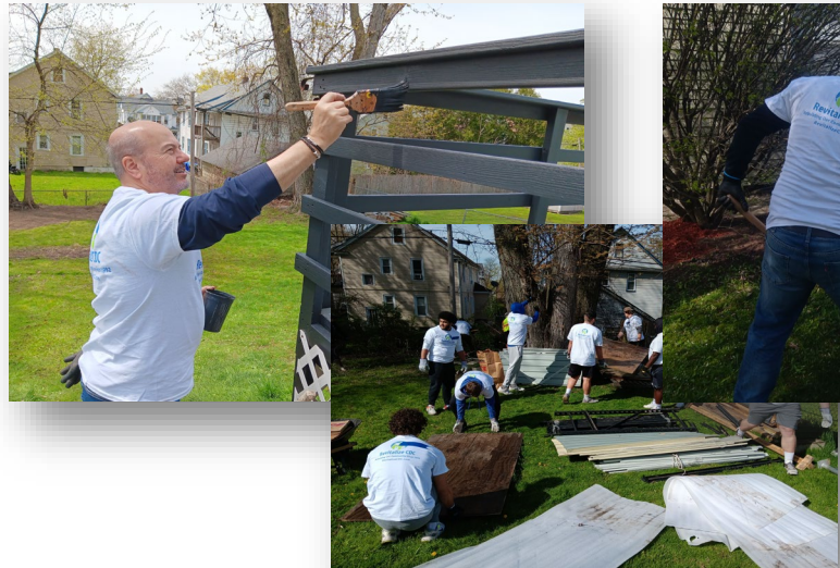
Revitalize CDC Neighborhood Cleanup