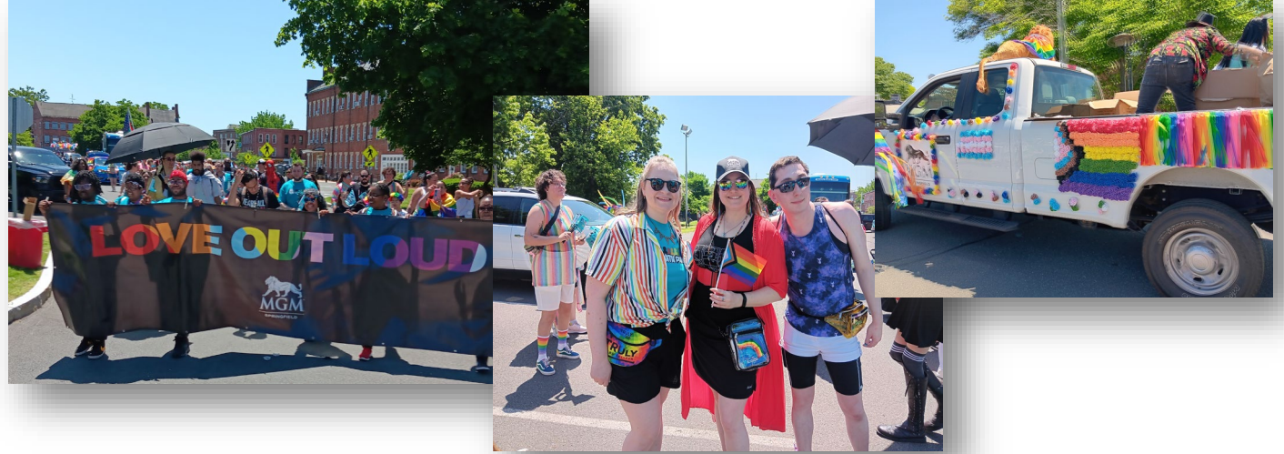
Springfield Pride Parade