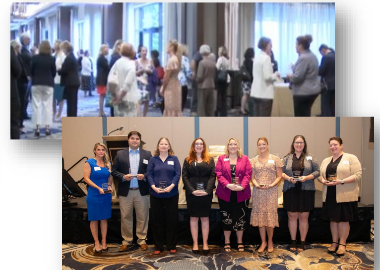
Chamber Annual Meeting