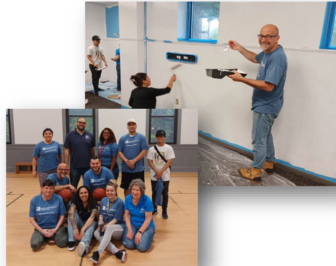
YMCA Volunteer Painting Event