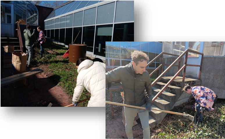
Adopt-a-School Clean Up