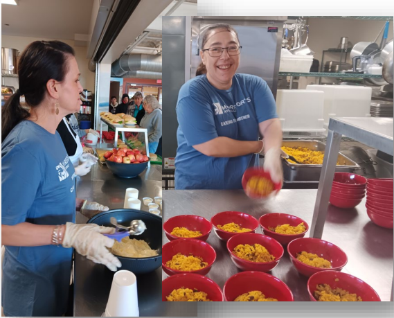
Friends of the Homeless