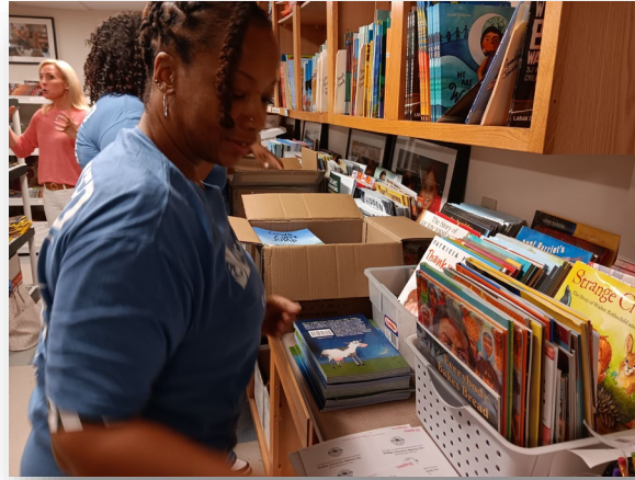
Link to Libraries Fundraiser