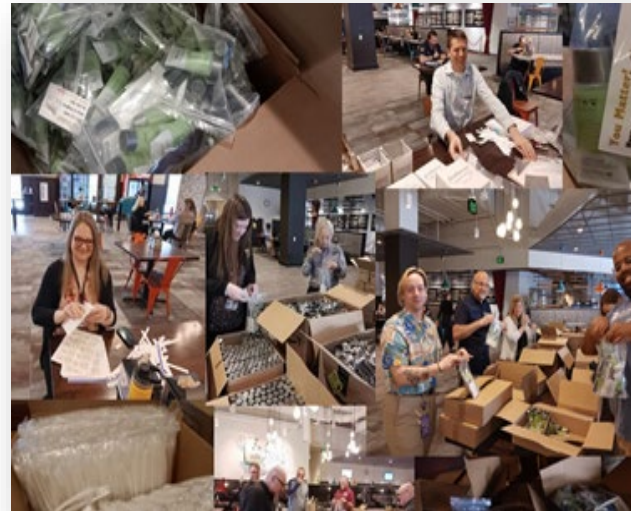
Hygiene Kit Volunteer Event