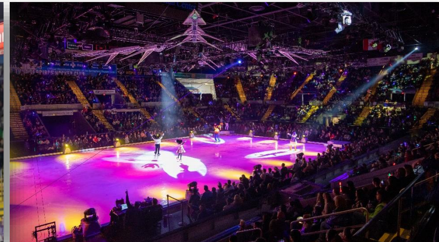
7 Disney on Ice Shows