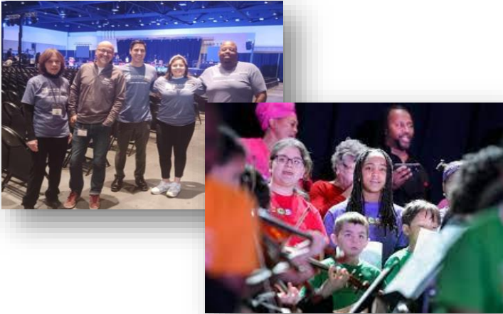
Springfield Music School Volunteer Event