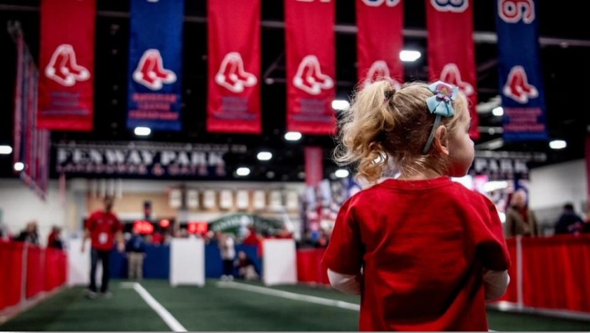
Red Sox Winter Weekend