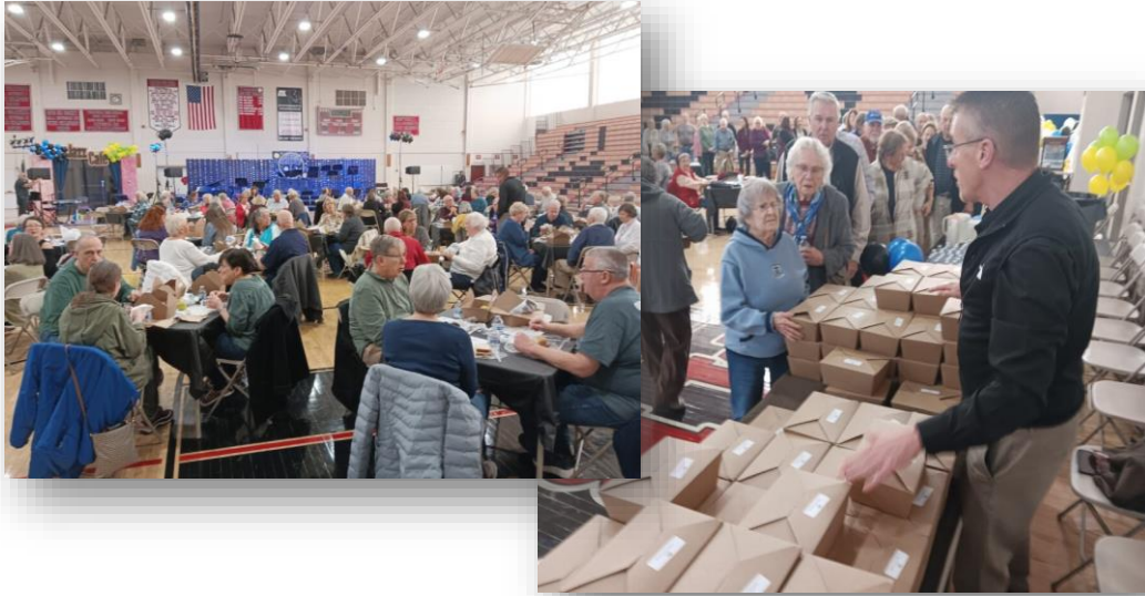
Westfield Senior Luncheon