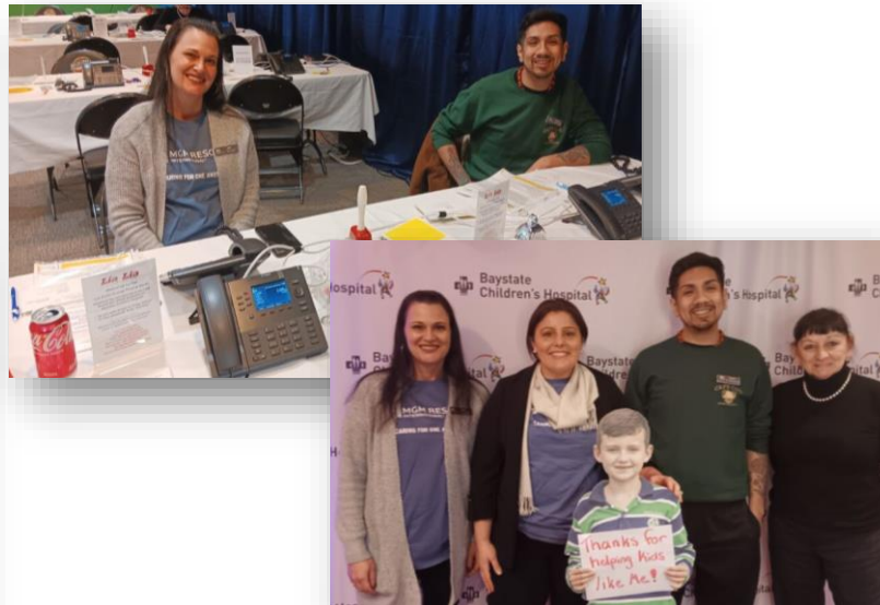
Baystate Medical Center Radiothon