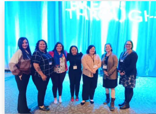
Bay Path University Women's Leadership Conference