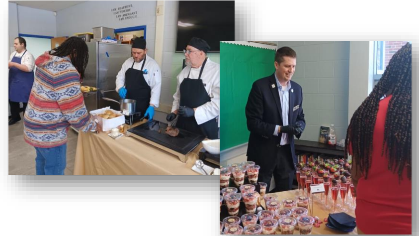
Valentine's Teacher Appreciation