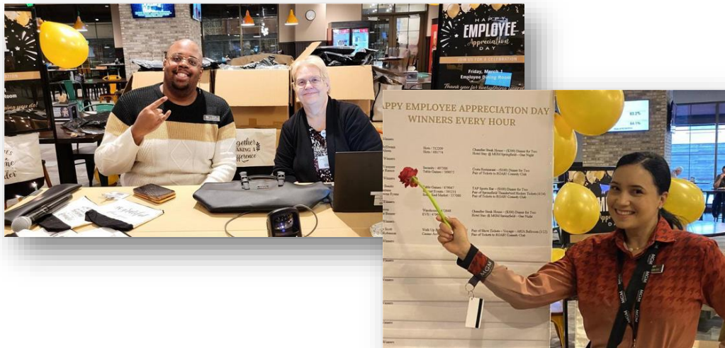
MGM Springfield Employee Appreciation Day