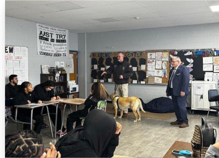
Career Day at Springfield Adopted School