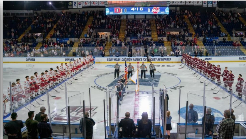
NCAA Hockey Regionals. First time in building history!

Televised on ESPN2 Over 500 hotel rooms in Springfield Over 11,000 tickets sold