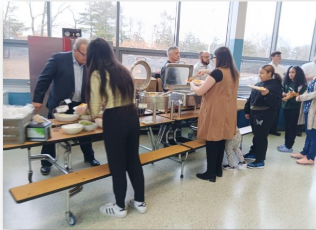
Adopt-a-School Family Night