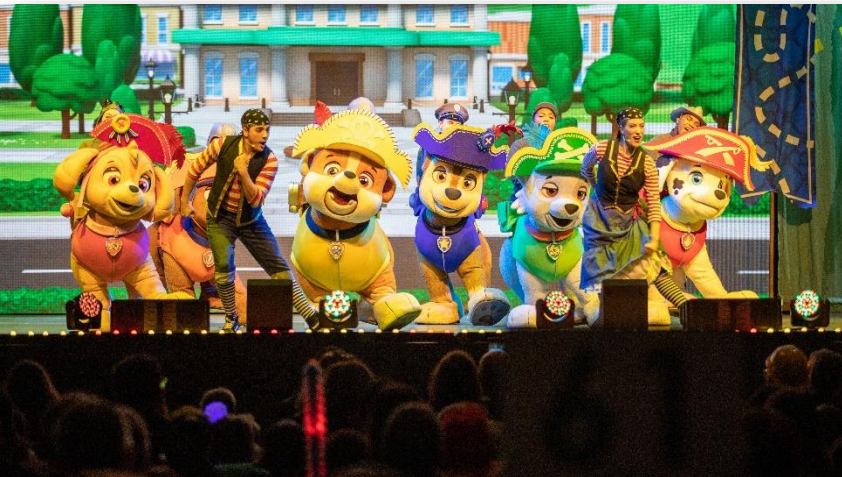
4 Paw Patrol Shows