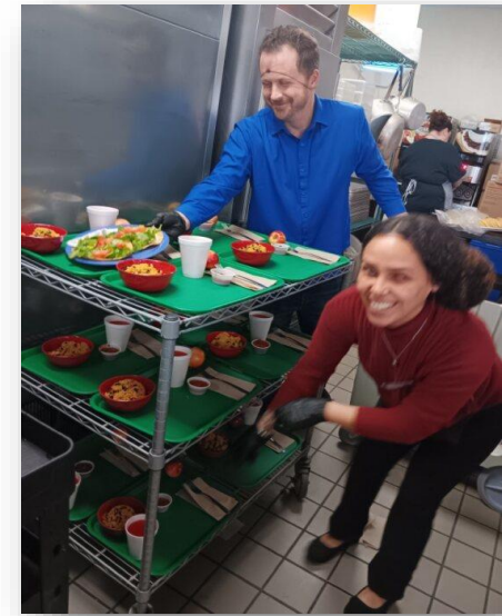
Friends of the Homeless