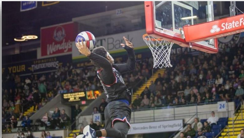
Record breaking Globetrotters Sales