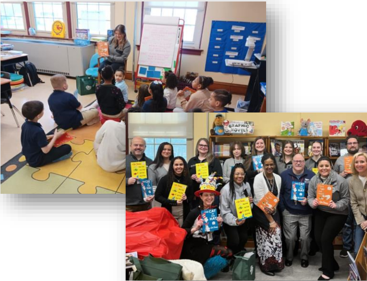
Dr. Suess Reading Day & Book Donation