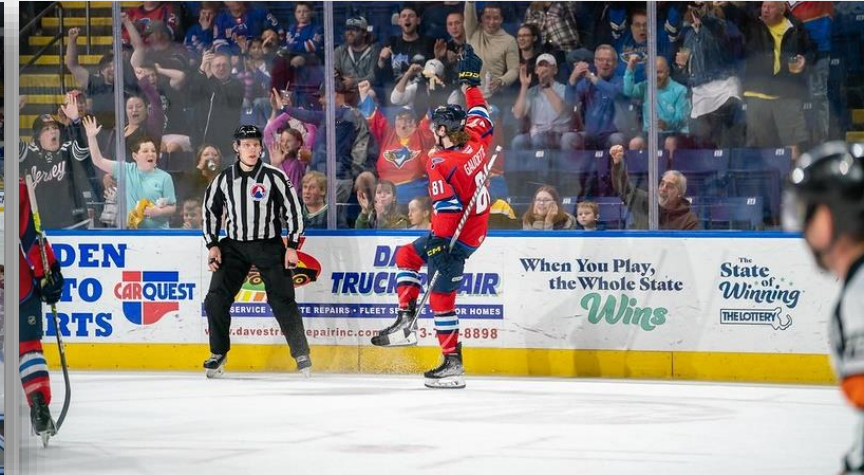
14 Straight Springfield Thunderbird Sell Outs

Televised on ESPN2 Over 500 hotel rooms in Springfield Over 11,000 tickets sold