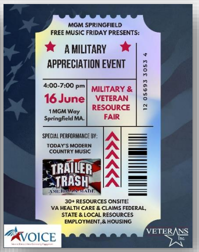
·Surprise Squad · Military Appreciation Event · Local Business Networking Event