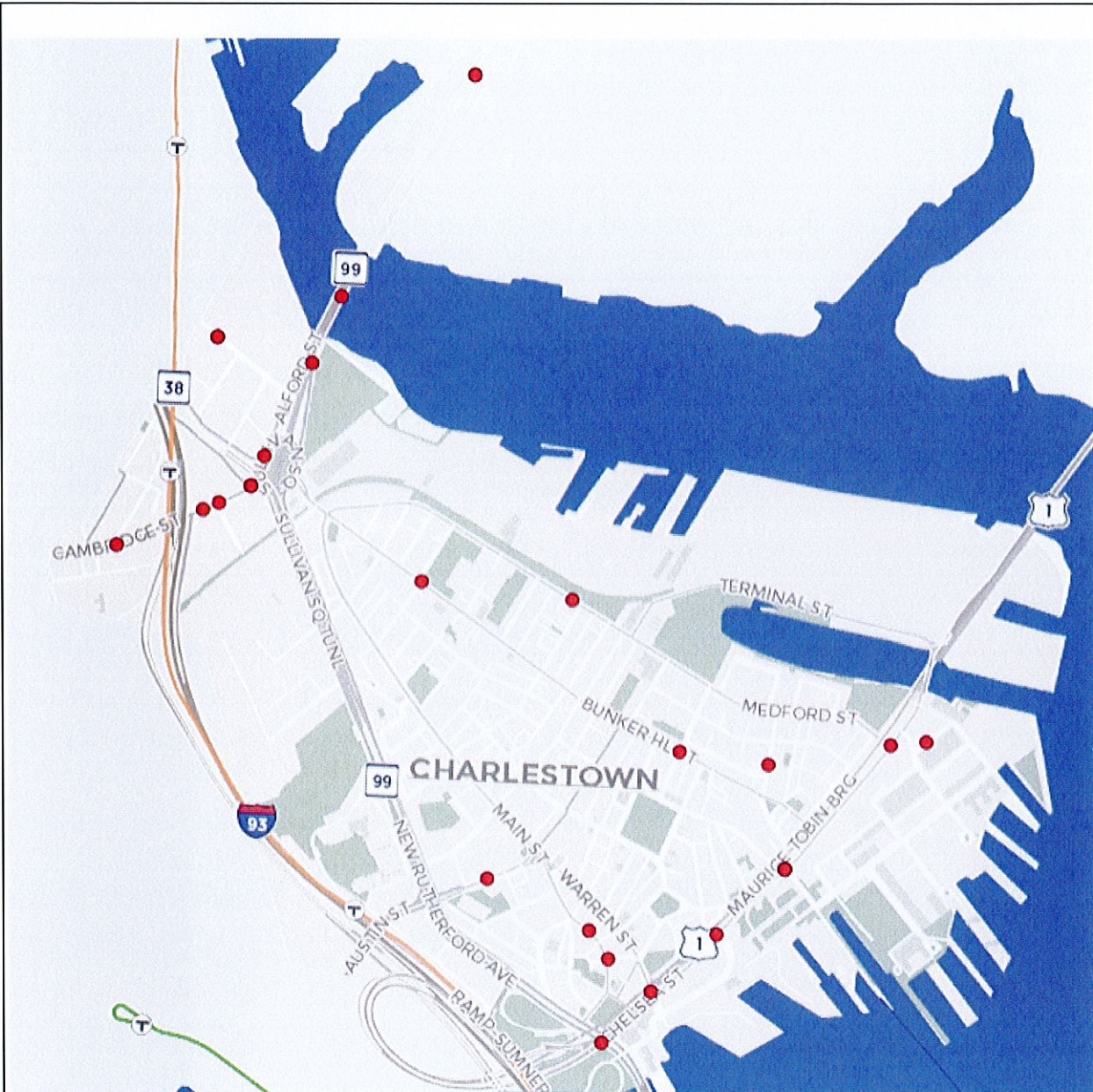
The next image shows the 48 cyclist-related crash locations that resulted in injuries or fatalities within a 1.5m radius of the casino in Boston, from 6/23/2019 to 1/30/2024.